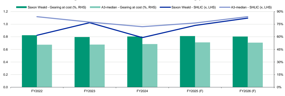
Exhibit 1 Debt and interest coverage metrics will remain weaker than rating peers